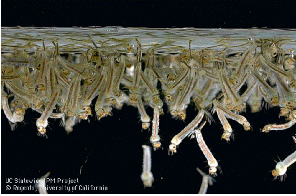
Culex mosquito larvae.